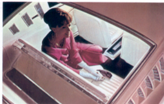
High-style interior in the Mustang Fastback 2+2

Still more suggestions to help you "design" your Mustang! Mustang 2+2 (above) displays these options: Styled Steel Wheels (with V-8's) and Accent Stripe (rocker moldings standard on all '66 Mustangs). Other options include: Choice of Three V-8's (up to 271 hp!) • T-bar Cruise-O-Matic • AM Radio/Stereo-Sonic Tape System • Ford Air Conditioner • Deluxe Seat Belts with Reminder Light • plus options shown here, on preceding and following pages.