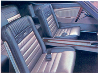
Rich Interior Decor Group* offers unique embossed seat inserts, door panels with pistol-grip door handles, built-in arm rests, safety-courtesy lights and more (below)