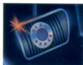
Fade-resistant Front Disc Brakes**