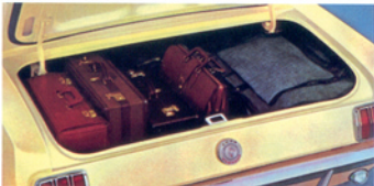
Mustang's trunk is surprisingly spacious and well-planned for easy loading