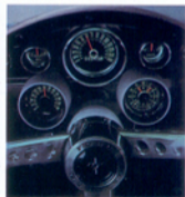
Night-lighted Rally Pac (clock & tach)* *Options