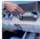
AM Radio-Stereo-sonic Tape System*