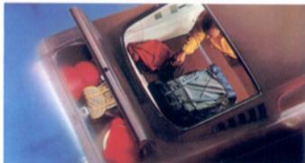
Folding rear seat triples the Fastback's luggage space. Door opens to trunk area