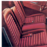
Full-Width Front Seat with folding arm rest!