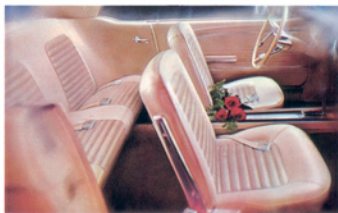
Mustang's deep-foam bucket seats and pleated vinyl trim come in your choice of five colors

Start here to make your kind of 1966 Mustang! Options shown on Mustang Hardtop (left): Vinyl Roof Covering (also avail. in white), Accent Stripe (rocker panel moldings are standard on all '66 Mustangs), Deluxe Wheel Covers (with simulated knock-off hubs). Others include: Choice of Three V-8's (up to 271 hp!) • 4-Speed Manual Transmission • Power Steering • Power Brakes • plus options shown here and on following pages.