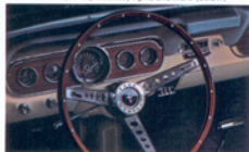
Woodlike Deluxe Steering Wheel, instrument panel and glove box trim are part of Interior Decor Group*