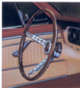
Woodlike Deluxe Steering Wheel*