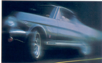
Mustang's Special Handling Package* (heavy-duty suspension, 22 to 1 overall steering ratio)